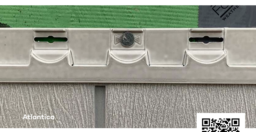
Scan here for Beach House Shake Technical Resources and Installation Guides.

Beach House Shake was designed to be installed with most common nail guns to further speed installation.