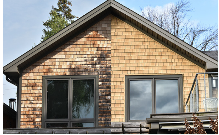
Sandcastle Ontario, Canada