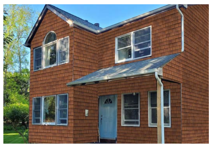
PROPOSED Using the Beach House Shake Online Visualizer

A homeowner from Southampton, New York was not happy with the look of his home. Like all exposed natural cedar, it had discolored quickly, unevenly, and was unsightly. He submitted this "Before" photo and asked for help with a visualization using Beach House Shake. The local Sales Rep assisted the homeowner and provided the below "Proposed" image. The homeowner was thrilled with the look and proceeded with the transformation. In late 2022, the homeowner sent us this "After" photo to show how his dream had finally come to life. With the Beach House Shake Visualizer, seeing is believing!