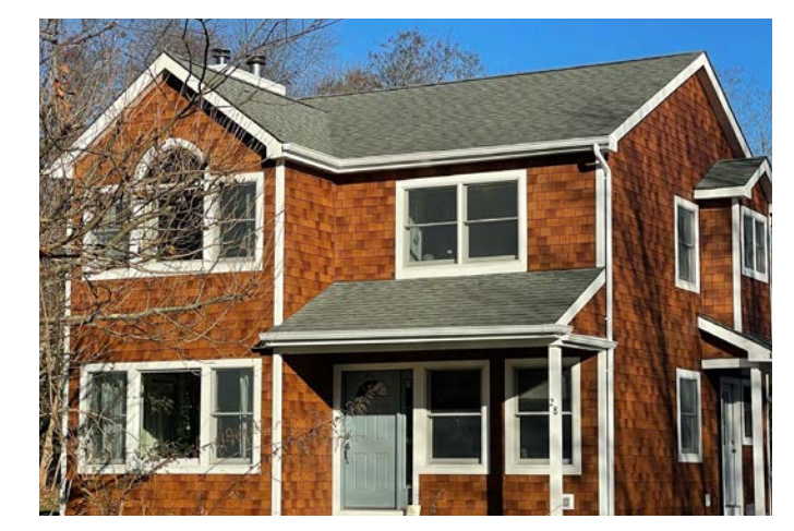
With Beach House Shake Pacifica Installed